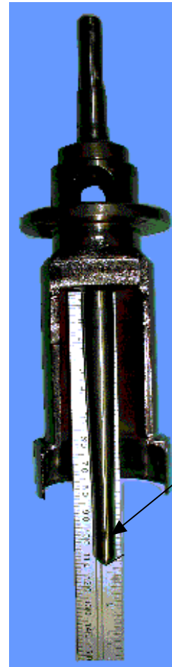
Blade & Whorl Assembly

Minimum axle length, to tip, to qualify for rebuild is 108mm